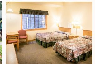
Comfortable sleeping arrangements