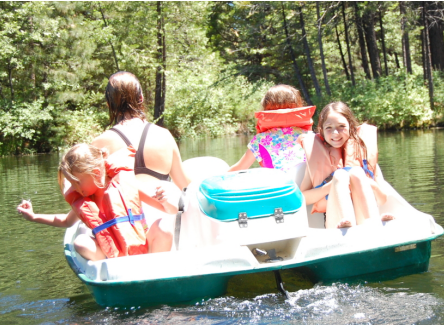
KAYAKS & PADDLEBOATS