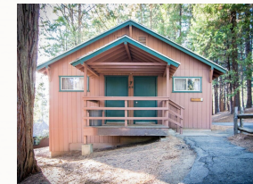
Mountain View cabin