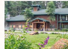
Cedar Lodge in summer