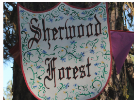
Sherwood Forest, where imagination comes to life

Sherwood Forest is tucked away from the rest of camp, and has a Robin Hood theme. Imagination comes to life with a Castle backdrop for dramas, a Loche, a Green for games, an Outdoor Amphitheater surrounded by Giant Sequoias and more. Twenty huts house eight each and are organized into six hamlets. Each hamlet has a campfire for cooking and a shared bathroom facility. Capacity: 160