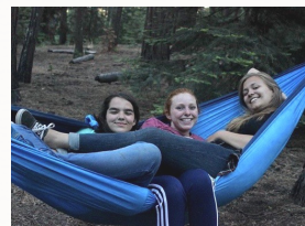
Sleep under the stars