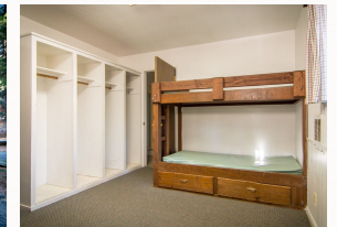
Roomy interior with closet space and a private bath